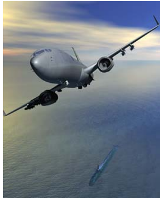
Multi-mission Maritime Aircraft