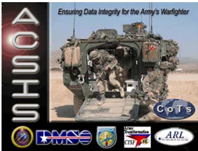
ACSIS: Supporting Operations in Iraq